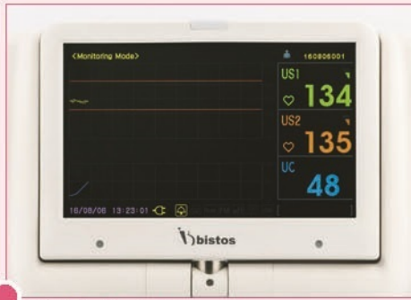
BT-350 LCD Graphic mode