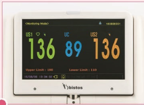
BT-350 LCD Number mode