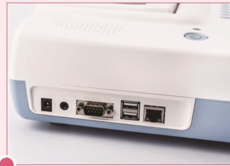
USB port for data export